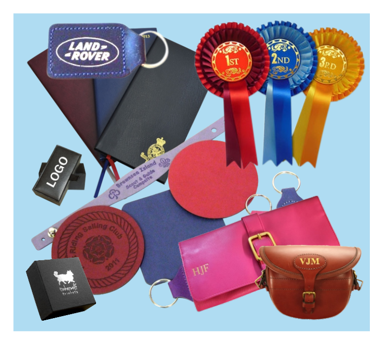
Emboss & Deboss onto 100's of items