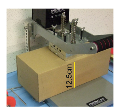
Print as high as 12.5cm (Approximately 5")