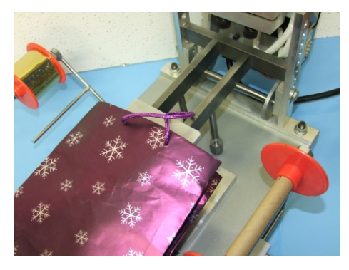
Our innovative 'Floating Bed' makes it easy to print Hand Bags, Gift Bags, Shoes/Trainers etc.

The FOILCRAFT 4x3 packs all the features often only found on machines costing far more.